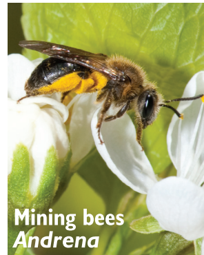
Mining bees Andrena