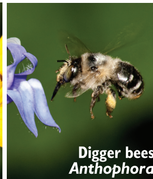
Digger bees Anthophora