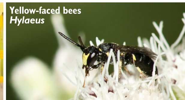
Yellow-faced bees Hylaeus