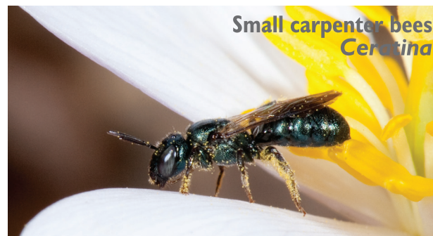
Small carpenter bees Ceratina