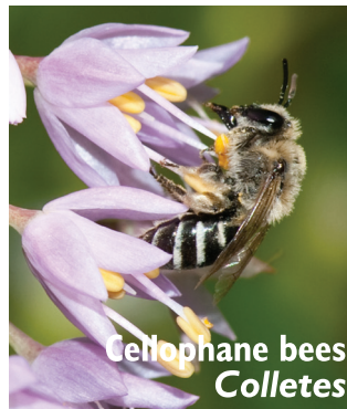
Cellophane bees Colletes