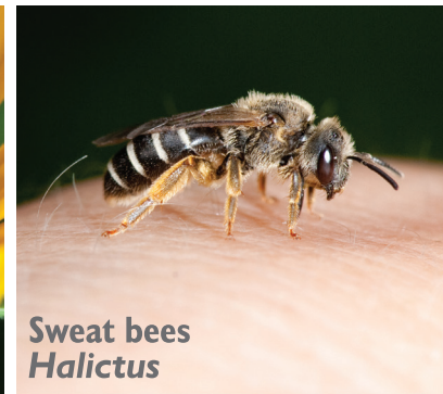
Sweat bees Halictus