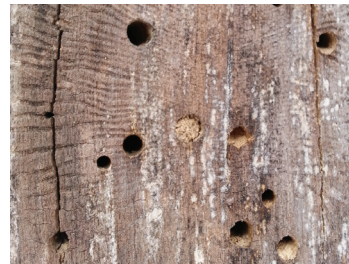
Holes in standing dead trees