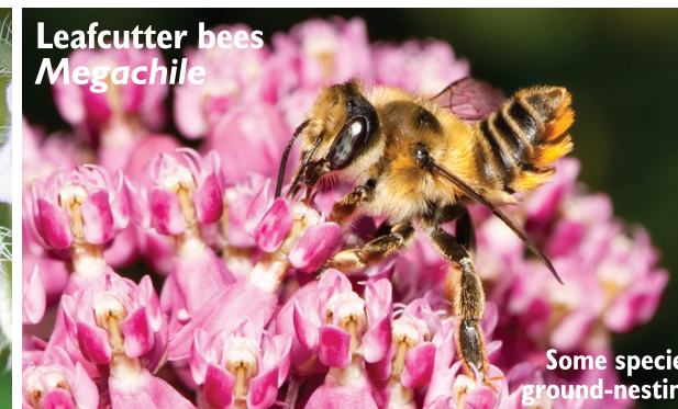
Leafcutter bees Megachile