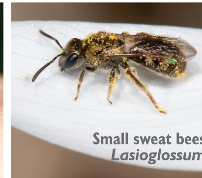
Small sweat bees Lasioglossum