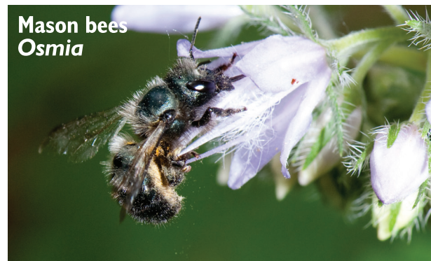
Mason bees Osmia