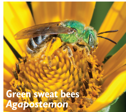
Green sweat bees Agapostemon