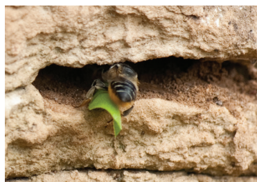
Cavities in rocks