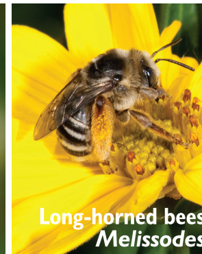
Long-horned bees Melissodes