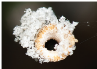
Cavities in plant stems